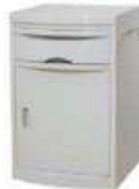
Bedside cabinet WH15033119