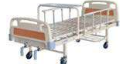
Manual 3-function WH15032104