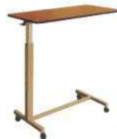
Bedside table WH15033118