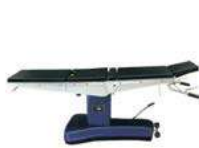
Electric operating Table WH15033111