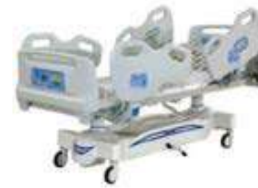
Electric bed WH15031100