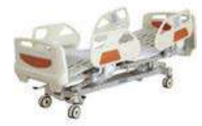
Electric bed WH15031102