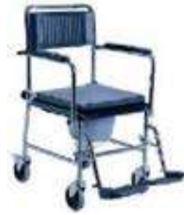
Nursing chair WH19031103