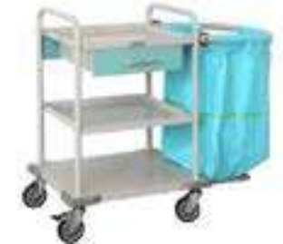
Nursing Trolley WH15033125