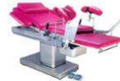
Electric Parturition bed WH15031104