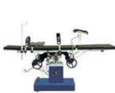
Manual operating Table WH15033112