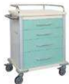
Medicine trolley WH15033121