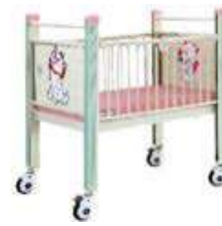
Infant Bed WH15033100