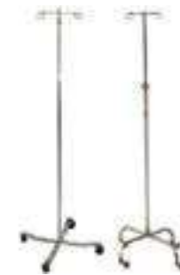
Iv stand WH15033126