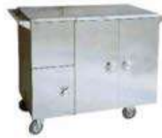
Food trolley WH15033115