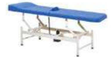
Examining bed WH15033131