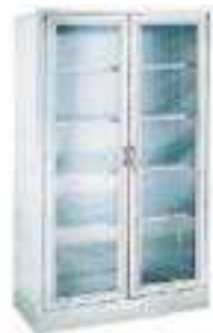
Instrument stand WH15033117