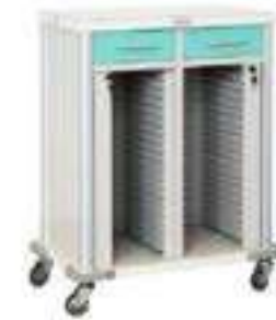
Document trolley WH15033123