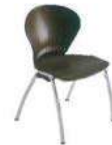
Waiting-Room chair WH15033133