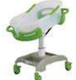
Infant bed WH15031105