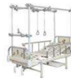
Infant Orthopedics bed WH15032100