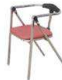
Nurse chair WH15033132