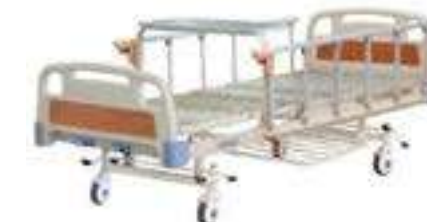
Manual 2-function WH15032103