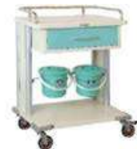
Treatment trolley WH15033122