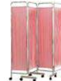
Fold Shielding WH15033130