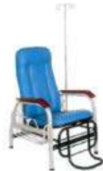
Infusion chair WH15033113