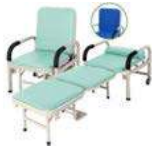
Accompany chair WH15033114