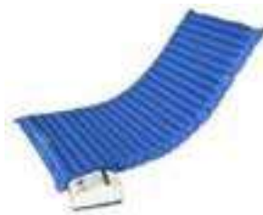
Air mattress WH15062105