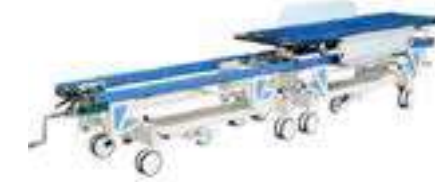
Operating Trolley WH15033127