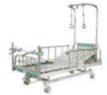
Orthopedics bed WH15032101