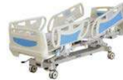
Electric bed WH15031101