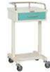
Instrument Trolley WH15033124