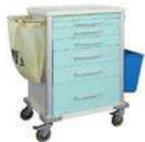
First aid trolley WH15033120