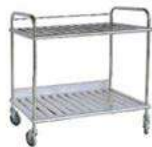
Dressing Trolley WH15033116