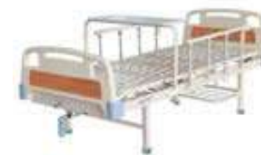
Manual 1-function WH15032102