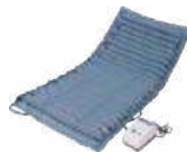
Air mattress WH15062102