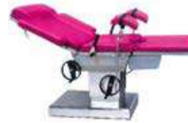
Manual Parturition bed WH15031103