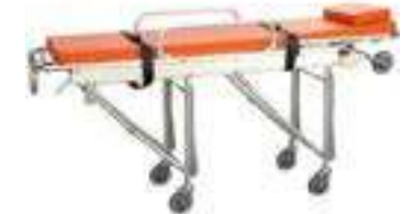
Stretcher Trolley WH15033128