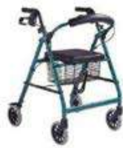
Shopping rollator WH19031102